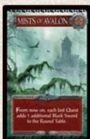
Mist of Avalon