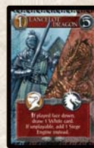
Lancelot & Dragon