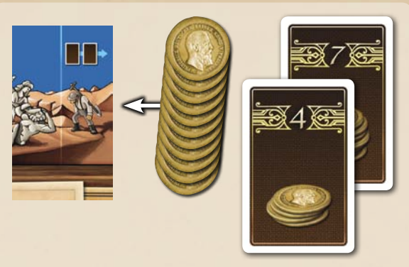
Example: The two cards show 7 and 4 coins, so 11 coins are laid out.

Now, turn the two cards face-up and lay out the corresponding number of coins next to the game board.