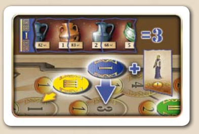
The reminder card shows what you have to do when exhibiting a collection.

On each space of the exhibition plan there may only be 1 marker sitting at the same time. When a new collection is exhibited at the museum, the interest in all existing exhibitions of the same or a lower value decreases. Move each marker that has the same or lower value than the new collection one space down.