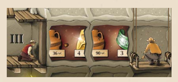
Example: You choose gallery III and pay 3 coins. You take the two finds and lay them out in front of yourself.

Lay out the newly excavated finds face-up in front of yourself. If you already own finds from previous turns, simply add the new ones to those.